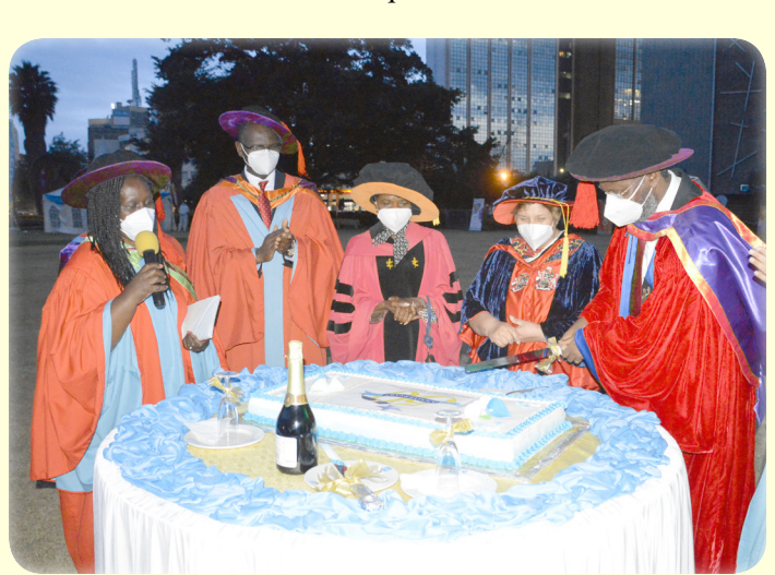
The Vice-Chancellor cut the @50 celebrations cake; looking on is the Chancellor. Chair of the Council, and DVCs RIE and FPD

From July 1, 1970, the University of East Africa was dissolved and the three East African countries set up their national