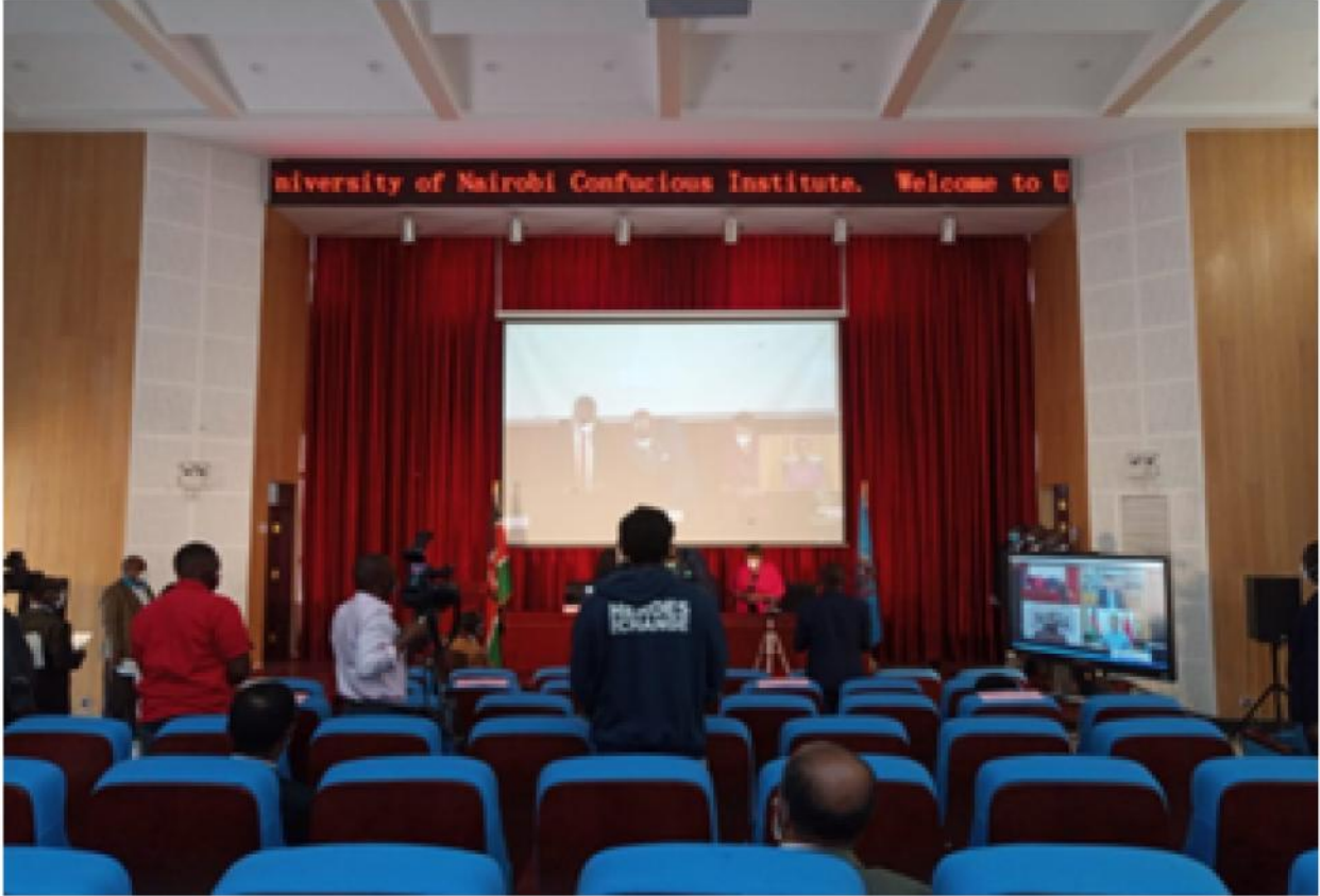
The virtual cum physical handing over ceremony was conducted at the 150 capacity Auditorium

The building is on a prime land of 3.13 acres valued at KES 900 M. The entire complex is fully furnished and equipped and was built through a grant by the Peoples Republic of China at a cost of KES 1.4 B. The total built up area is 6,000 square meters consisting of teaching facilities, multi media Laboratories, public and exhibition spaces, hostels and parking.