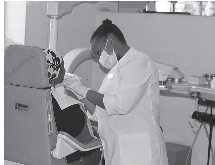
Conservative and Prosthetic Dentistry

Details on specific admission requirements of the school, credit transfer and exemptions, course structure and duration, examination regulations, course outline and award of degree may be obtained from the School. Please contact: