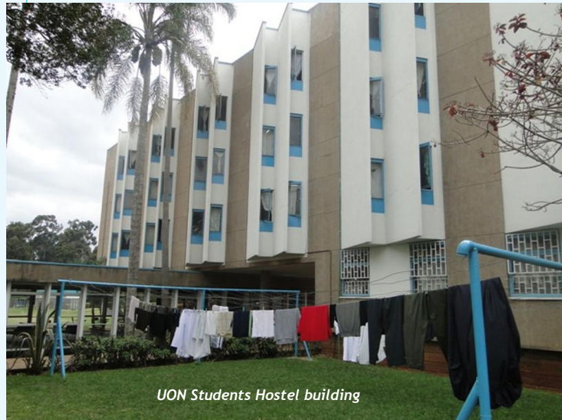
UON Students Hostel building

In 2019, SWA faced challenges that included; continued rising cost of goods and services against subsidized selling prices, accommodation and catering services, limited financial resources, over