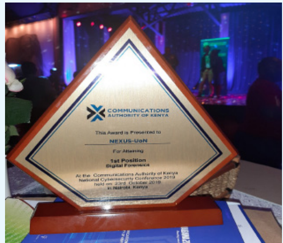
First position Digital Forensics Award