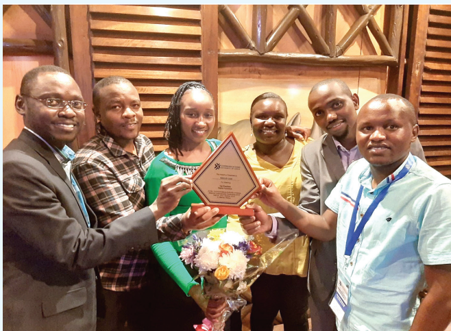
Masters Students in the School of Computing and Informatics holding their trophy after winning in the in the Communication Authority Cybersecurity Hackathon

The award ceremony was held on Friday 25 th October. The teams were awarded certificates and trophies. The first position teams also received membership to join KCSFA (Kenya Cyber Security and Forensics Association) and a fully paid course on Digital Forensics by the Communications Authority.