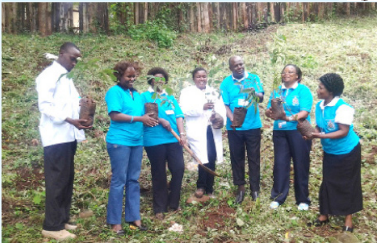
Planning Division staff at a tree planting exercise